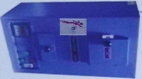
Sanitary Napkin Incinerator